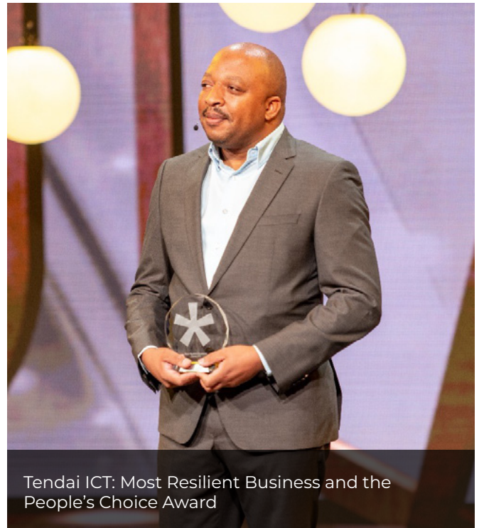
Tendai ICT: Most Resilient Business and the People's Choice Award

This year's NEDAs categories were formulated with the intent of giving due recognition to entrepreneurs who have made great strides in the midst of an ongoing pandemic. We would like to proudly congratulate this year's winners: