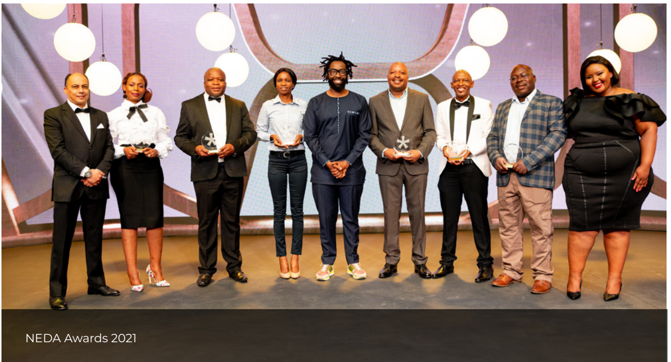
NEDA Awards 2021