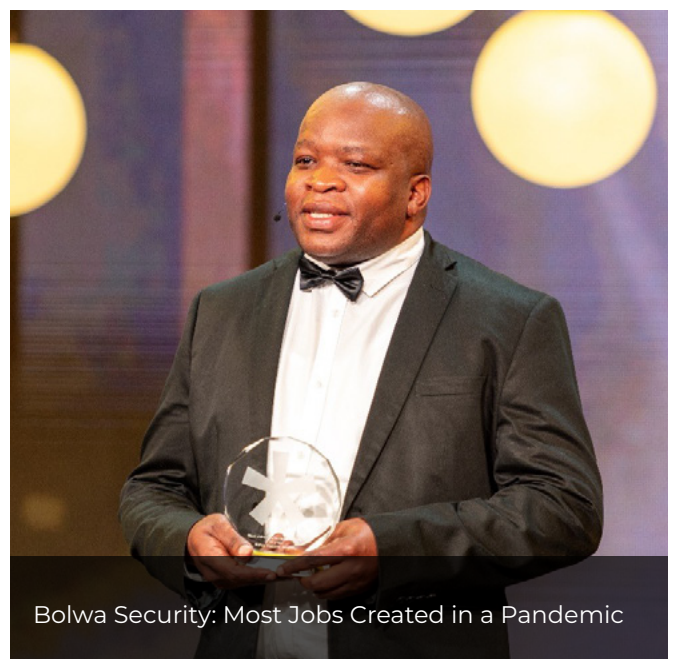
Bolwa Security: Most Jobs Created in a Pandemic