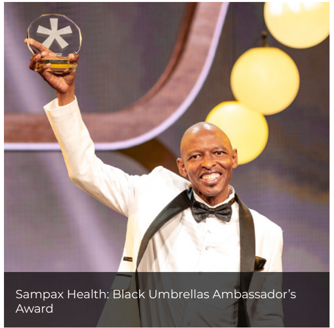
Sampax Health: Black Umbrellas Ambassador's Award